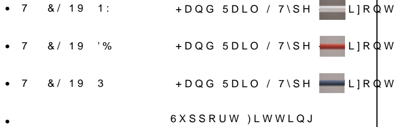
T112CL6NV1#NW1/ T112CL6NV1#DB9/ T112CL6NV1#P7